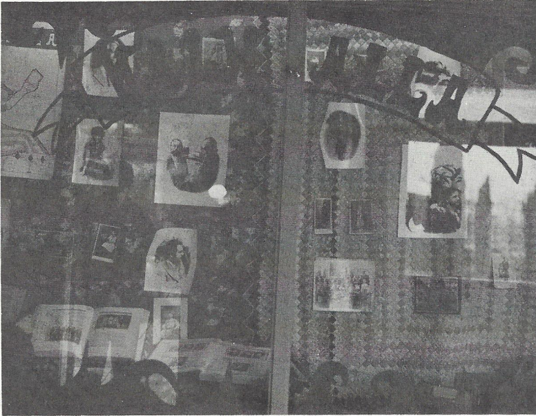
Various sections of this year's Valhalla are on display in the A-hall showcase. If 730 more annuals are not sold by Friday the yearbook will be cancelled.